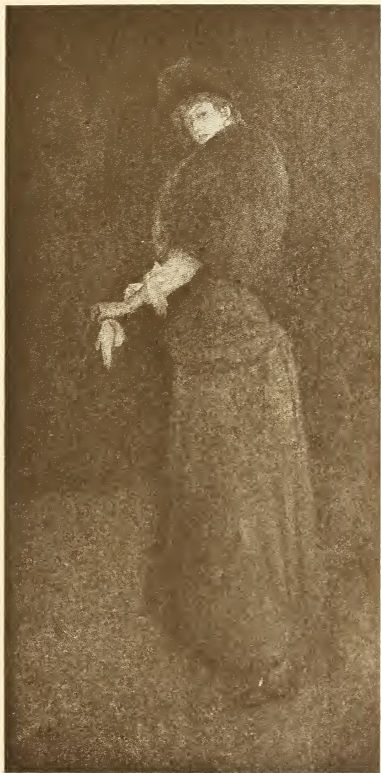
THE LADY WITH THE YELLOW BUSKIN.

In the W. P. Wiltach Collection, Philadelphia.